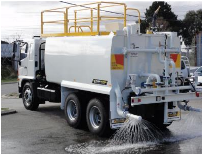
Water cart used to mitigate dust

The PTP Alliance will use dust monitors at strategic locations throughout construction to ensure compliance levels are met.