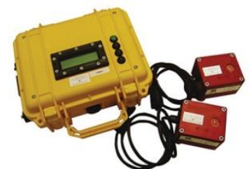
Vibration monitoring device

The PTP Alliance will measure vibration levels throughout the project to ensure compliance levels that are set by the Environment Protection Authority are adhered to. It is important to note that experiencing vibrations, does not mean that structural damage will occur to properties.