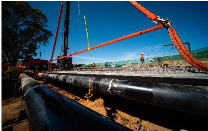
SA Water mains to sit under the new Morphett Road bridge

September and October were busy months. The project has been working closely with utility service providers- SA Water, SA Power Networks, Telstra and APA to install multiple services within and around the project site.