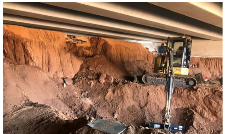
Excavating under the western side of the Morphett Road bridge

The project is able to excavate fully under the new road bridge after the pour, and road tie-in works will follow in the New Year.