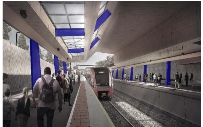
Columns and steel highlighted in blue

Bridgeworks: With the remaining 9 'Super-T' beams lifted into place, the deck pour occurred in mid-December.