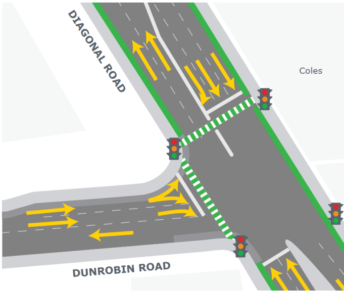
New traffic signals and wider intersection with additional lane

In the New Year, stormwater, kerb demolition, pavement widening and asphaltting works will take place. The existing Diagonal Road pedestrian crossing will be shifted further south, to line up with the new signals. The intersection will be complete by April 2019.