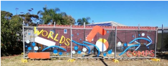
Themed artwork to assist with wayfinding to the SA Aquatic and Leisure Centre

The next artwork will be installed in mid-December in Railway Terrace, to highlight the group of businesses located here.