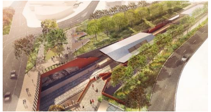
Artist impression station overview

Bowhill Engineering also constructed the pedestrian and cyclist bridge, as well as main steelworks for the station.