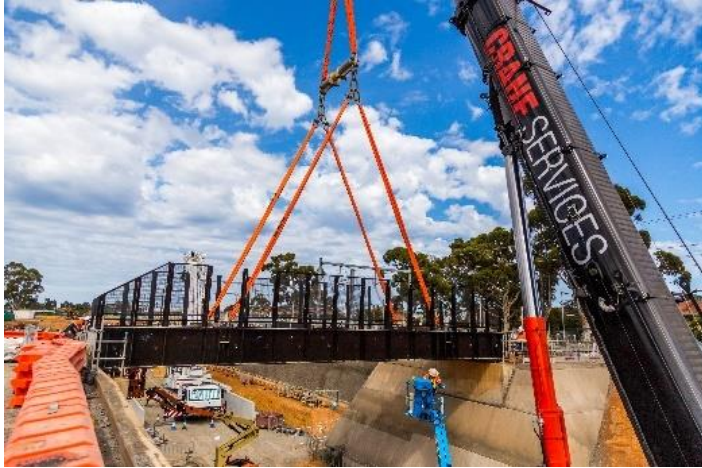
Pedestrian and cyclist bridge lifted into position on 4 November 2018

Opening the bridge will provide commuters and residents with additional access to the existing railway station and surrounding area.