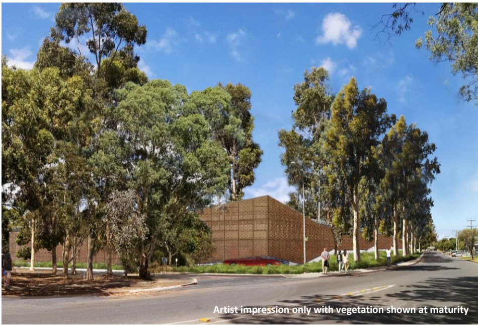
Artist impression only with vegetation shown at maturity