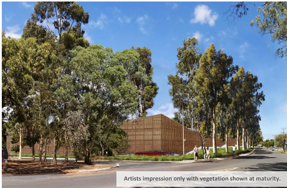
Artists impression only with vegetation shown at maturity.