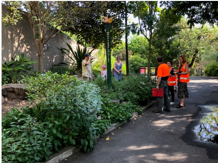
Adelaide Zoo Horticulturalist providing information to the project team about how to establish butterfly gardens.

Species will be selected to enhance local habitat and will likely include species that can support a butterfly garden.