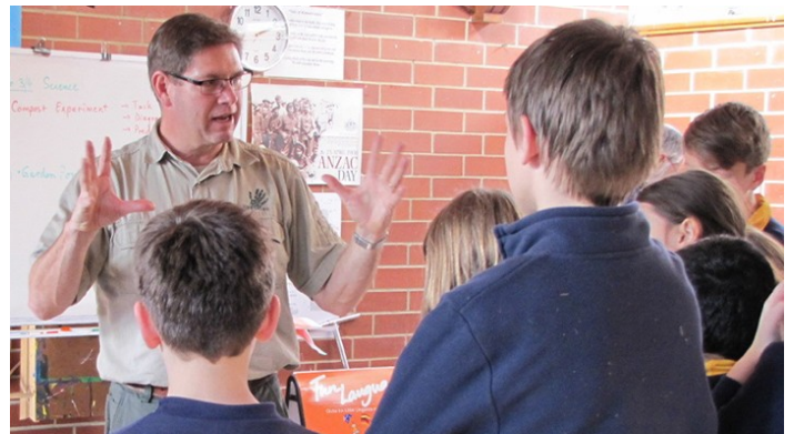
Local school wildlife workshops involve the community in helping to enhance local habitat.

The Community Wildlife Project is a DPTI initiative that involves local communities in helping to offset the loss of habitat caused by necessary vegetation removals.